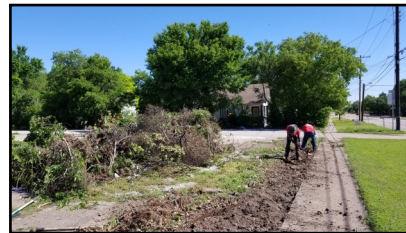
Before and after photos of the parking lot landscaping.

We are very proud of our new landscaping in the parking lot. We appreciate everyone who contributed! THANK YOU!