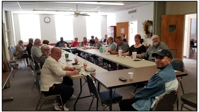
Wednesday Dinner & Discussion May 5, 2021