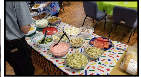
Member Care Committee, July 12.