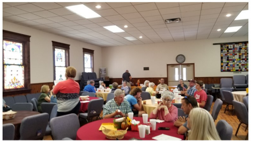
LORD'S DAY FESTIVAL 2021