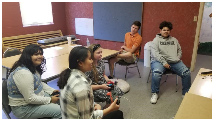
The Youth of Ferris Heights have a little free time before beginning the study of Youth Alpha Course.