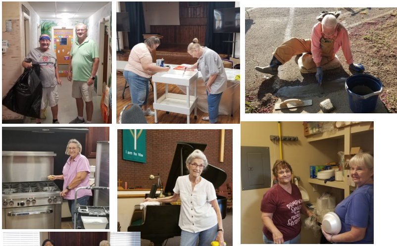
Work Day September 24, 2022 THANK YOU!