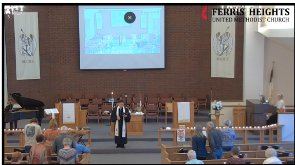
All Saints Sunday. Special altar candles lit during communion.