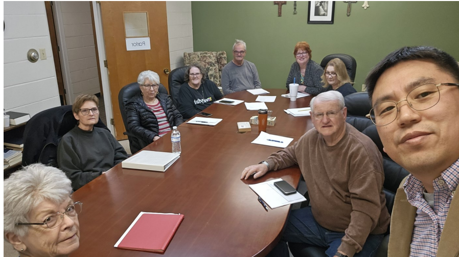
January Board Meeting in the Parlor Room; Texas Nameplate Company generously donated the table and chairs to our Congregation.